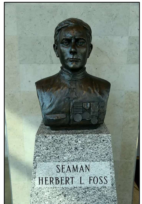
Foss statue at Hingham boat terminal.