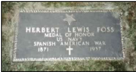
Herbert L. Foss grave site in Hingham

In 1937, Foss collapsed while working in the cemetery. Taken to the South Weymouth Hospital, he later died of a coronary embolism on September 1, 1937 at the age of 66.