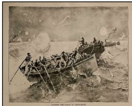
The Battle of Cienfuegos where Seaman Foss cut the cable linking Cuba to Spain

In two boats, sailors from the U.S.S. Nashville and the U.S.S. Marblehead were joined by a Marine guard as they moved 15 feet from the enemy shore. With great difficulty while under intense enemy fire, the men pulled the cable up over the bow of their ship and proceeded to sever it.